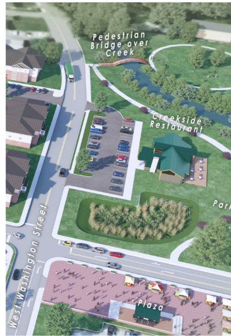
Concept Plan Excerpt